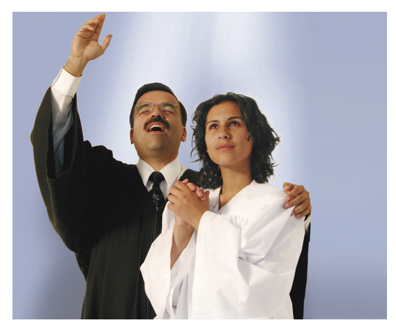
Those who accept Christ are baptized in His name.

To Jesus, baptism was very important. He told His followers to go and make disciples of all nations and to baptize them. (Matthew 28:18-20). Peter's sermon at Pentecost ended with this appeal: "Repent and let every one of you be baptized in the name of Jesus Christ." (Acts. 2:38) Later it states that "those who gladly received his word were baptized..." (Acts. 2:41). Those who accept Christ as Lord are instructed and expected to be baptized in His name.