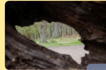
Left: Kirsty Hart (photograph)