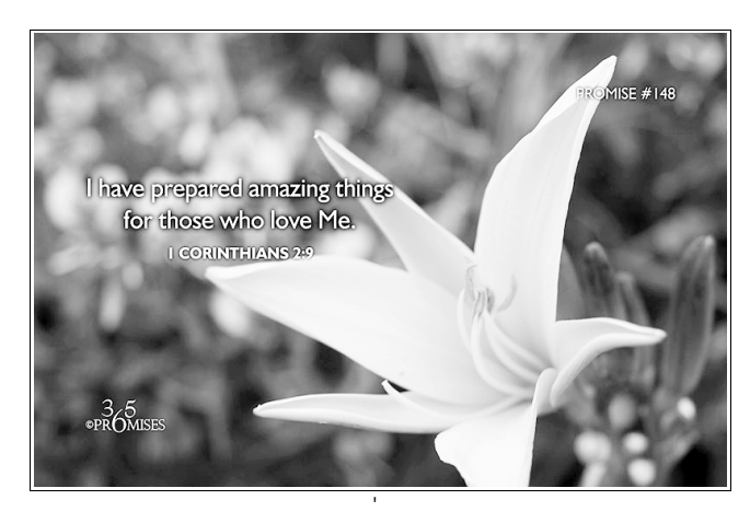
'I have prepared amazing things for those who love Me.' 1 Corinthians 2:9