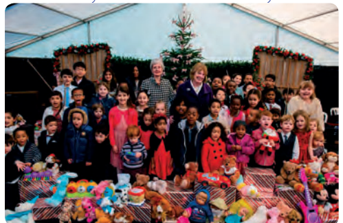
The Toy Service in the temporary marquee last year

You are warmly invited to come to the Toy Service.