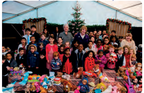
The Toy Service in the temporary marquee last year

You are warmly invited to come to the Toy Service.