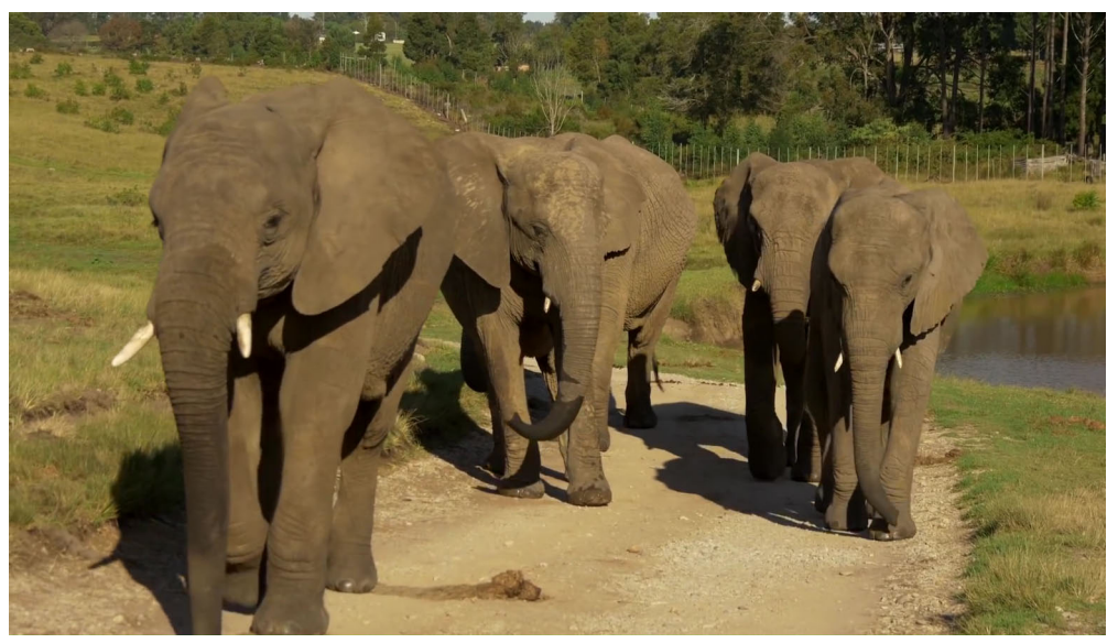
Up-close and personal in Africa

Dan managed to tick off two things on his bucket list - sky-diving from an aeroplane and swimming with sharks.