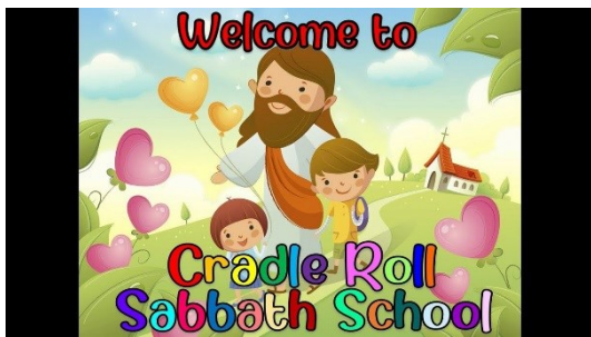
Cradle Roll Sabbath School - May 2020 (new video!)