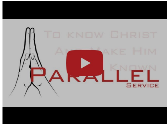
Parallel Service - Elder Arnoud van den Broek