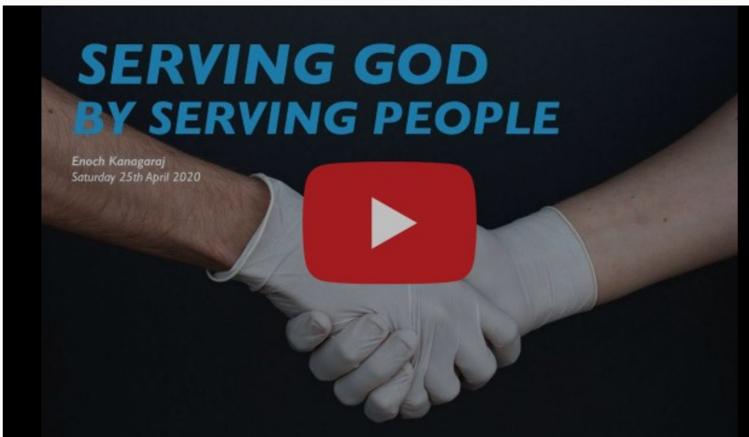
ADRA COVID-19 Emergency Appeal