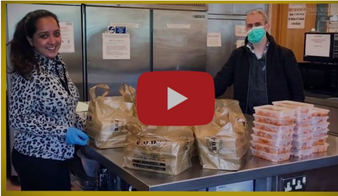
Serving God by Serving people - message by Enoch Kanagaraj