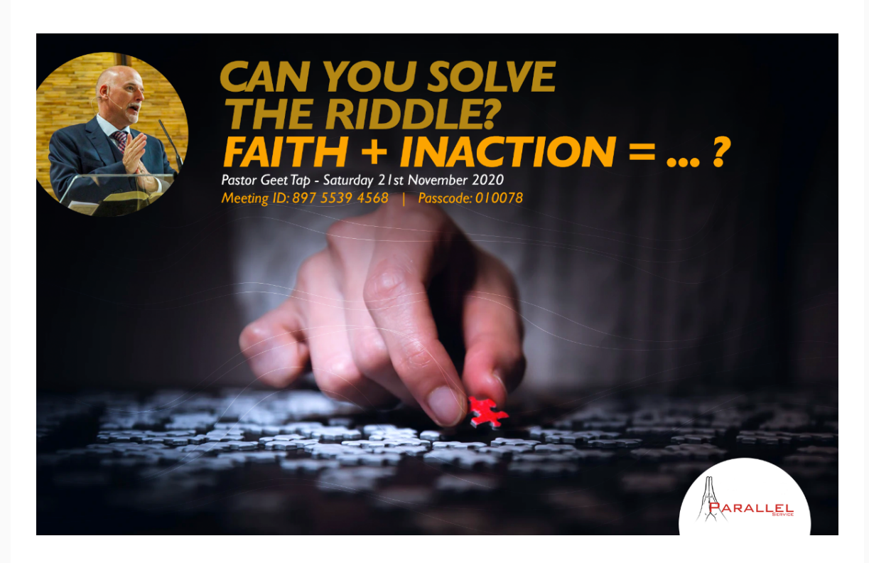
Watch the Paralell Service online with Pastor Geert Tap