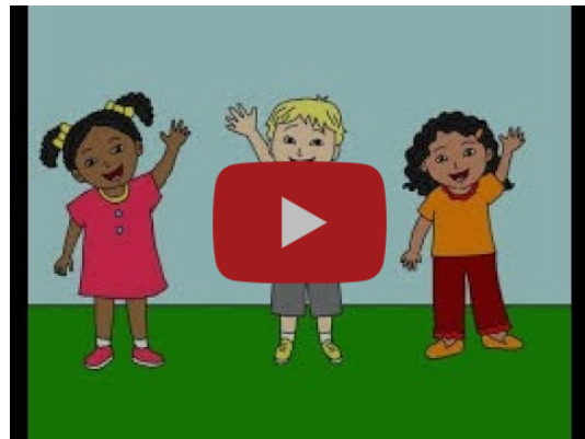
Cradle Roll Sabbath School - 3rd Edition November 2020

Invite a friend to subscribe to the eBulletin