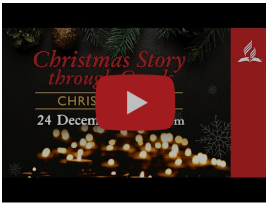
Christmas Story Through Carols