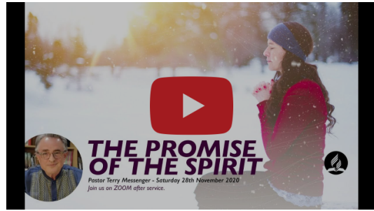
The Promise of the Spirit