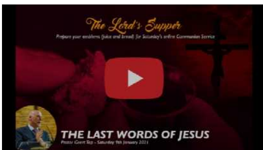
The Last words of Jesus