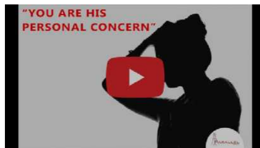
You are His personal concern