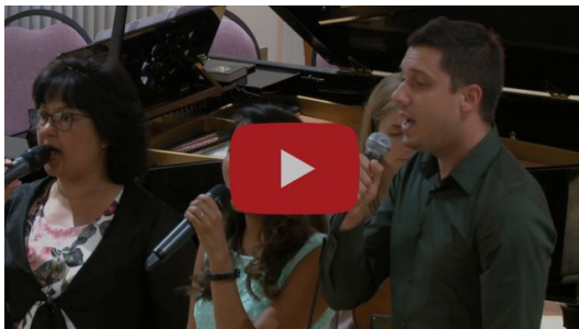
Vocal Ensemble at Stanborough Park Church