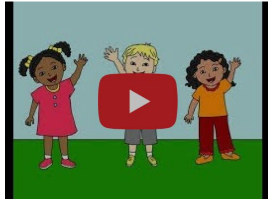
Cradle Roll Sabbath School - 2nd Edition of January 2021

Invite a friend to subscribe to the eBulletin