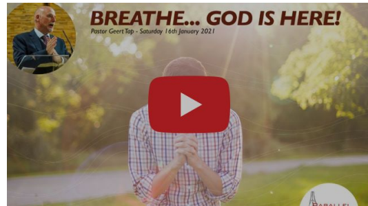
"Breathe... God is here"