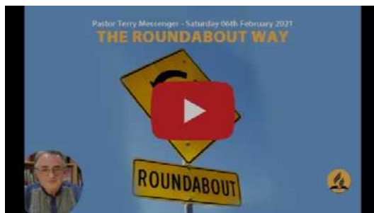
The Roundabout Way