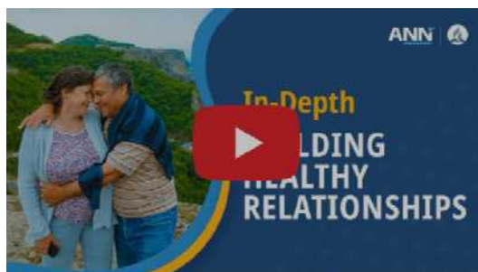
Practical Tips for Healthy Marriages and Relationships

Invite a friend to subscribe to the eBulletin