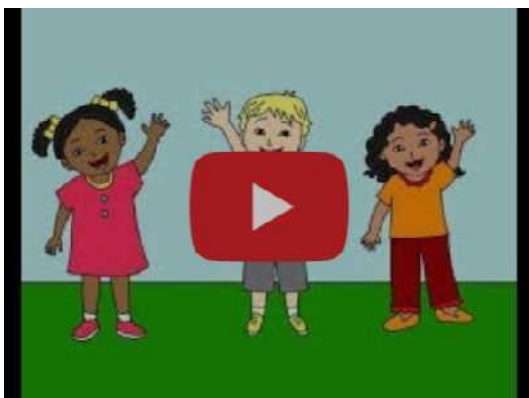
Cradle Roll Sabbath School - February 2nd Edition 2021