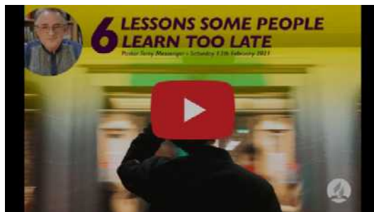
6 Lessons some people learn too late