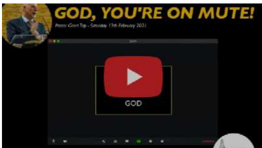
God, you are on mute!