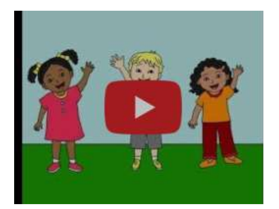
Cradle Roll Sabbath School - March Edition 2021