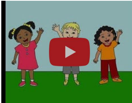
Cradle Roll Sabbath School - May 2021