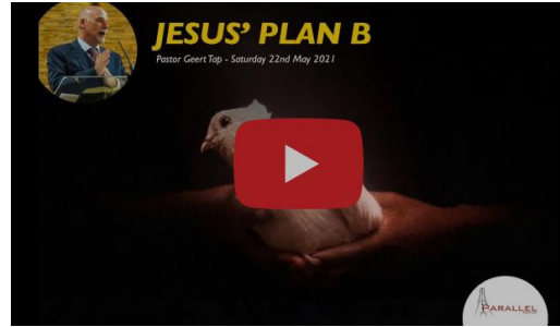
Jesus' plan B