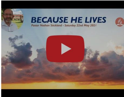
Because He lives