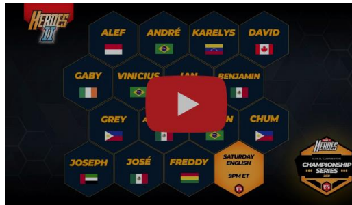
Bible Heroes World Championship

Invite a friend to subscribe to the eBulletin