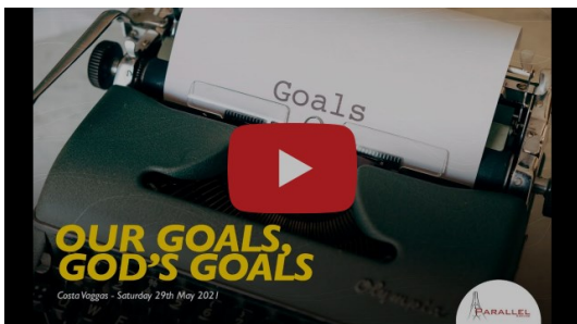
Our Goals, God's goals