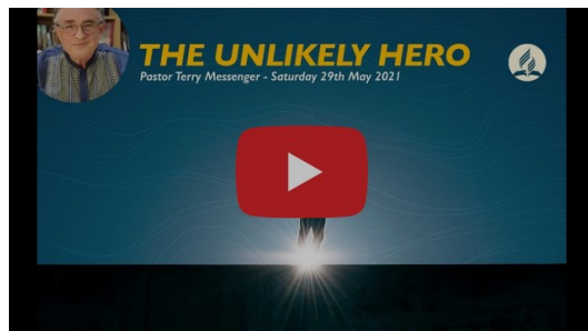
The Unlikely Hero