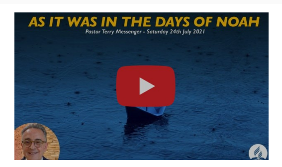
As it was in the days of Noah