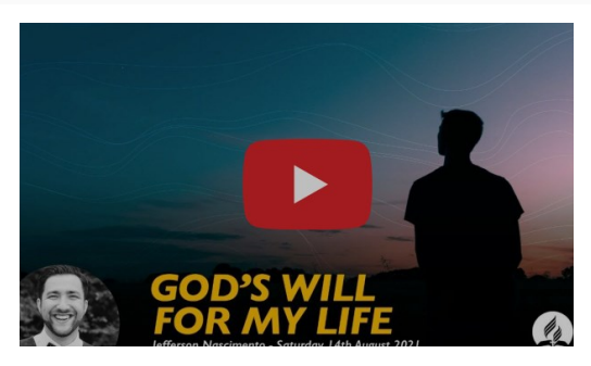
God's will for my life