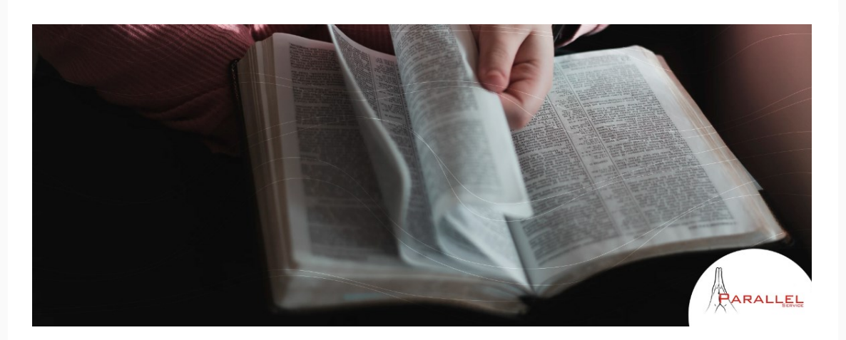
The <u>Parallel Service</u> will be at the park 12pm (weather permitting)