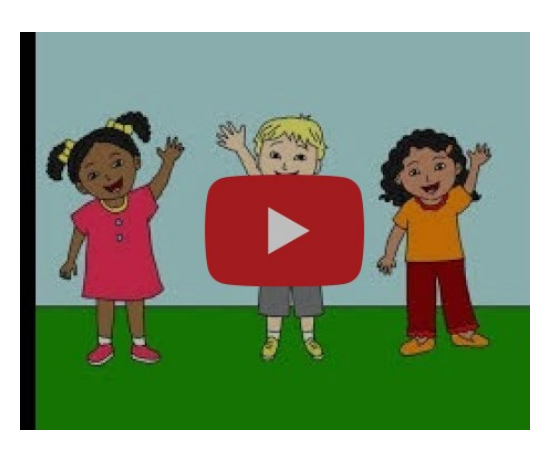
Cradle Roll Sabbath School - August 2021