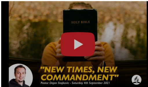
New times, New commandment