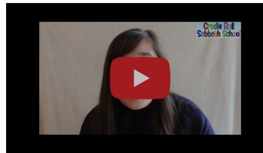
Cradle Roll Sabbath School - September