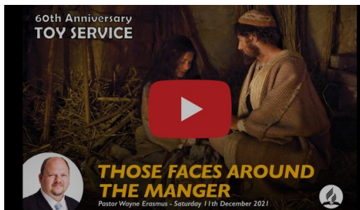
60th Toy Service