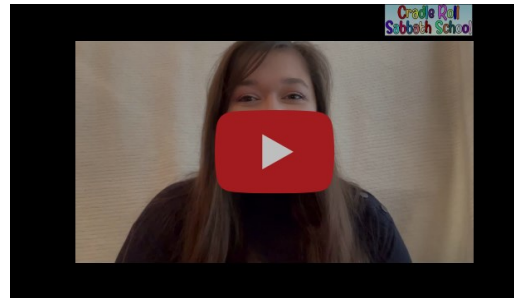
Cradle Roll Sabbath School - January 2022

Invite a friend to subscribe to the eBulletin