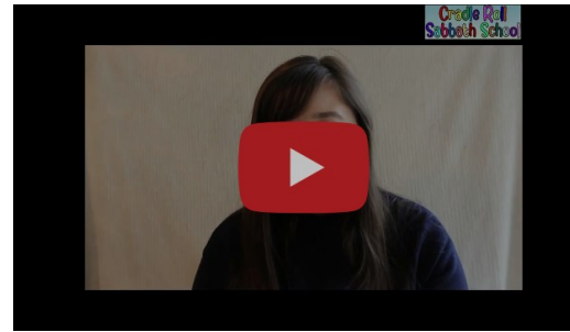
Cradle Roll Sabbath School - MARCH