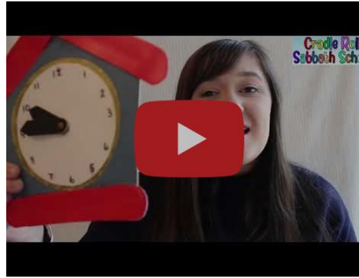
Cradle Roll Sabbath School - APRIL