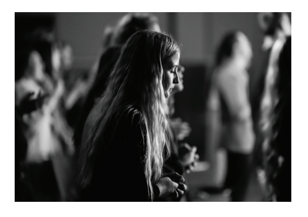
Give your burdens to the LORD, and he will take care of you. He will not permit the godly to slip and fall. Psalms 55:22 NLT