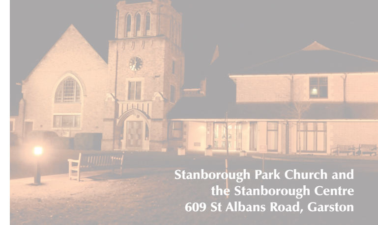
Stanborough Park Church and the Stanborough Centre 609 St Albans Road, Garston

For information about all these events and more, please visit www.stanboroughchurch.org