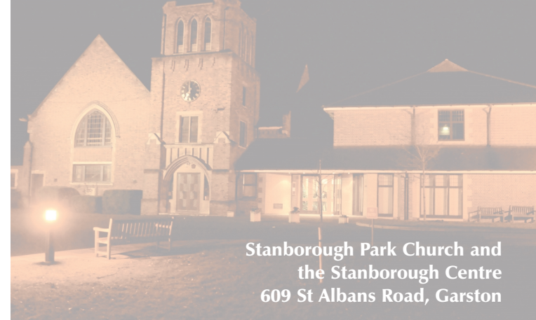
Stanborough Park Church and the Stanborough Centre 609 St Albans Road, Garston

For information about all these events and more, please visit www.stanboroughchurch.org or telephone 01923 894664.